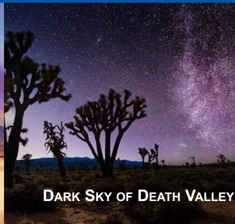
DARK SKY OF DEATH VALLEY