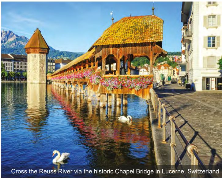
Cross the Reuss River via the historic Chapel Bridge in Lucerne, Switzerland