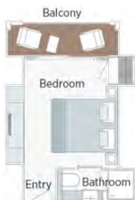
Grand Balcony Suite