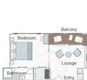
Owner's One-Bedroom Suite