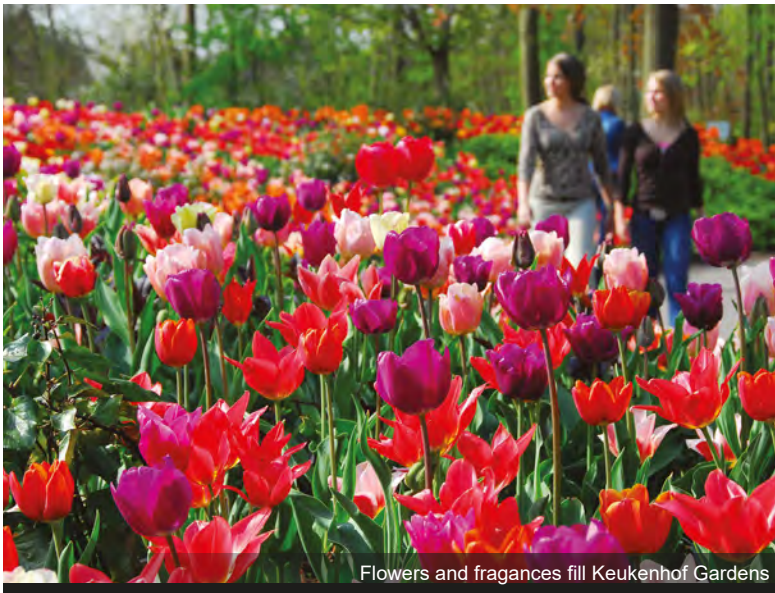
Flowers and fragrances fill Keukenhof Gardens

DAY 9 Cologne, Germany: Continue cruising along the Rhine River to Cologne. Founded by the Romans, the city is one of Germany's oldest and is famous for its magnificent UNESCO World Heritage-listed gothic cathedral. Join your local guide for an included walking tour of the city, touching on the historical charm of the Old Town and its Roman history. Traverse the quaint alleyways and see historic monuments alongside modern architecture. The tour concludes at the cathedral, whose twin spires dominate the skyline. This evening, back onboard, join your Captain for a farewell reception and dinner. Meals: B, L, D DiscoverMORE: Farina Eau de Cologne Museum (additional expense)