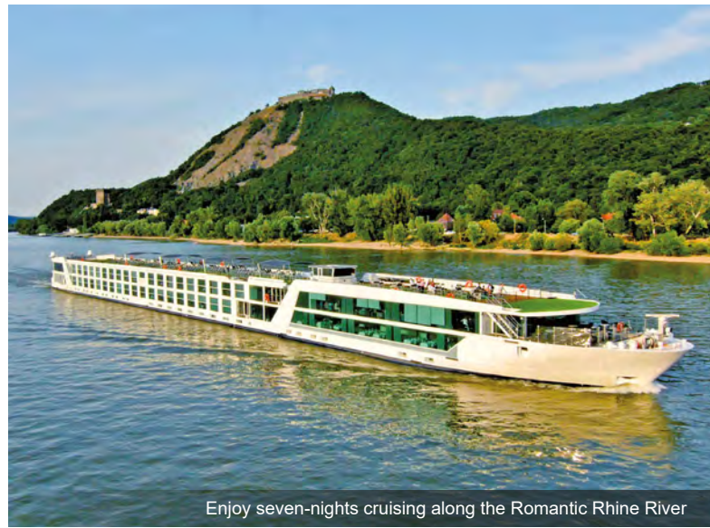
Enjoy seven-nights cruising along the Romantic Rhine River

DAY 1 Depart the USA: Today you'll depart the USA on your overnight flight to Zurich, Switzerland.