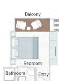
Panorama Balcony Suite